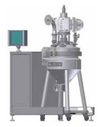
High-end design of CD

Mixing and heating at the same time – the process performed in the Conical Dryer for humid solids. If the vessel is designed acc. to GMP, the cover of the standard version is equipped with a tilting device or the complete plant is given a frame with slewing mechanism for the complete vessel and integrated electric control, the plant can be used for many other fields of application. The improved and cost favourable design of the IKA® Conical Dryer enables the execution of the plant that is required for your application.